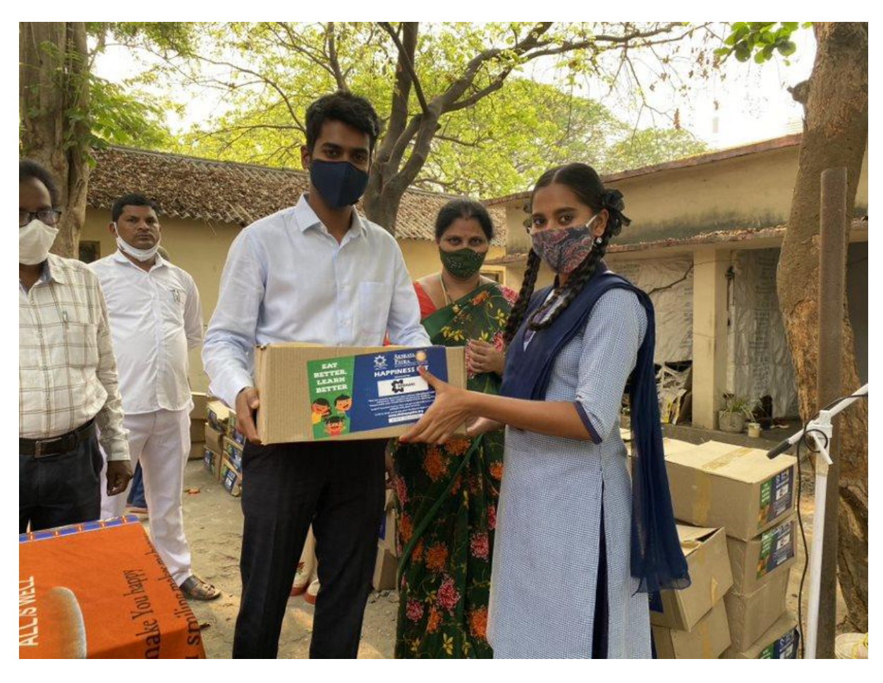
Additional Collector, Kothagudem distributing Happiness Kits to Govt School Children- Kothagudem.