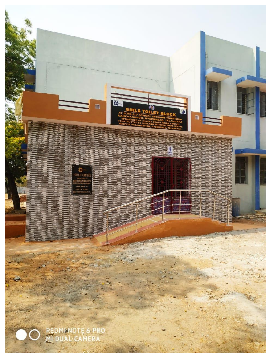
Toilet blocks constructed at BPDAV School