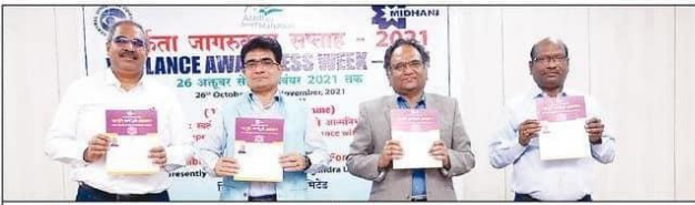
मिधानि में सतर्कता जागरूकता सप्ताह के दौरान जागृति पत्रिका का लोकार्पण करते अधिकारी।

कर्मचारियों के लिए 'स्वतंत्र भारत 75 : सत्यनिष्ठा से आत्म निर्भरता'